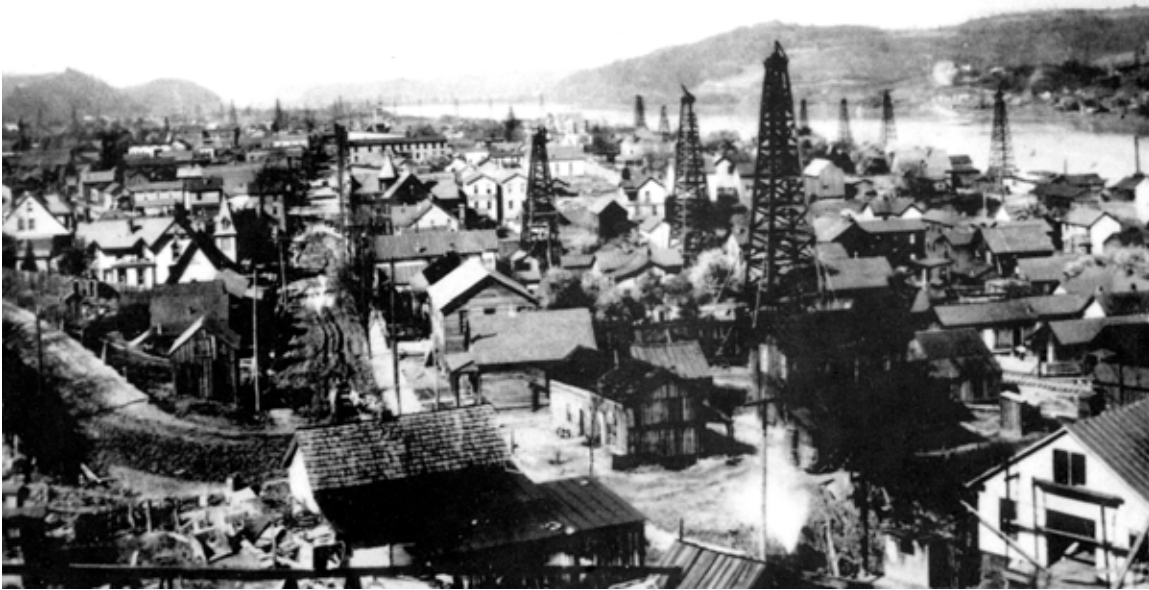
Sistersville, WV. The 1890 Oil Capitol of the World.

On behalf of the Petroleum History Institute (PHI), it is my pleasure to extend a personal invitation to join us for the PHI 2005 International Symposium on the History of the Oil Industry. I am confident that you will find the venue pleasing; the program interesting, informative and stimulating; the social events and company congenial and convivial – in total a most memorable learning and networking opportunity and experience.